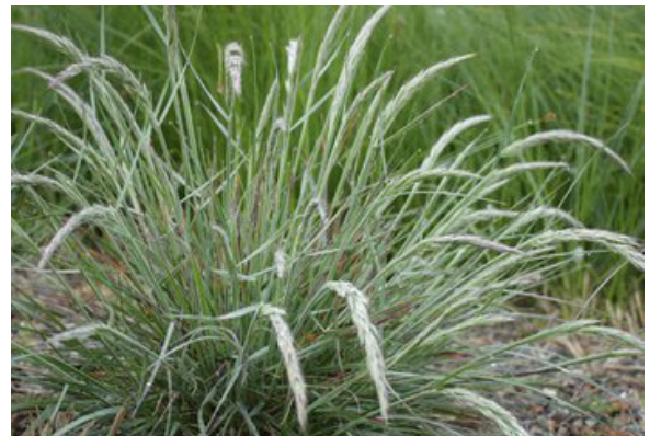
Pacific Reed Grass