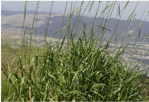
Giant Wild Rye

Conserving Local Flora and Fauna . This pamphlet is produced by the Open Space and Ecology Committee of the City of Brisbane and San Bruno Mountain Watch, and is free thanks to the Arthur and Elena Court Nature Watch Conservancy. Stop by City Hall for your free copy!