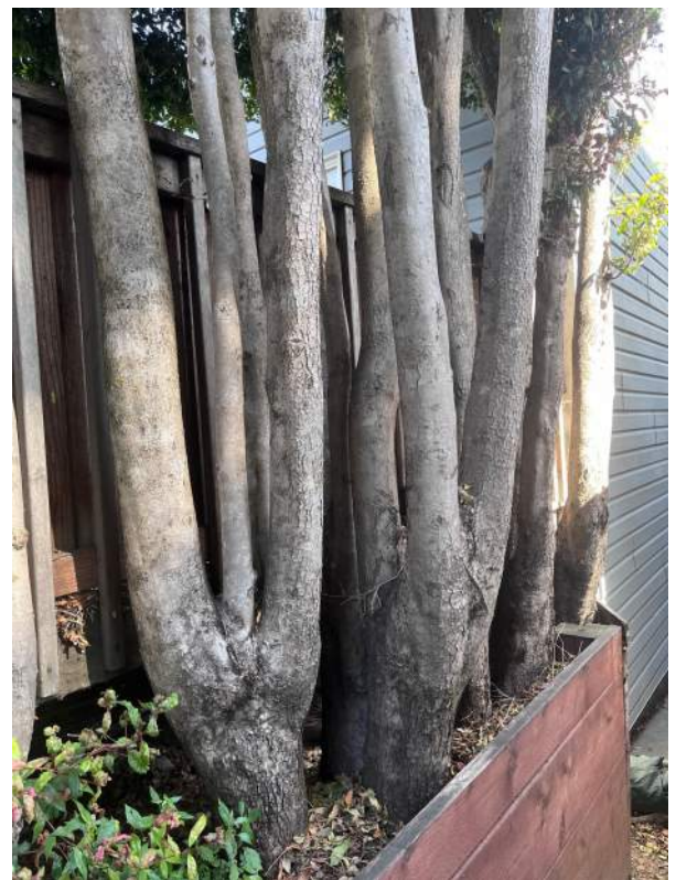
#9 (43"), #10 (30") #11 (49"), #12 (36")